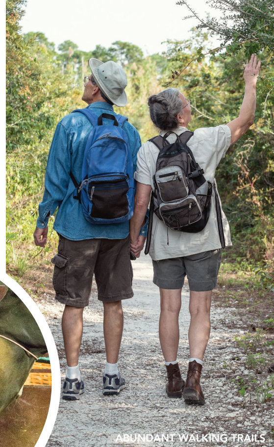
ABUNDANT WALKING TRAILS