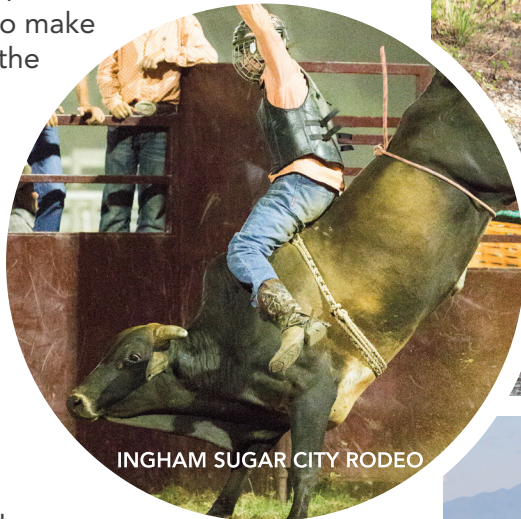
INGHAM SUGAR CITY RODEO

The affordability of the region provides the opportunity to live on the door step of some of the World's best fishing spots and natural attractions... and have the capital to invest in your recreational pursuits!