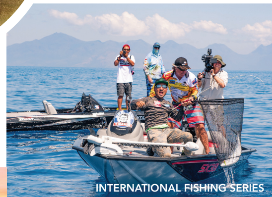
INTERNATIONAL FISHING SERIES